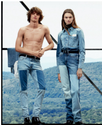
CALVIN KLEIN JEANS #MYCALVINS