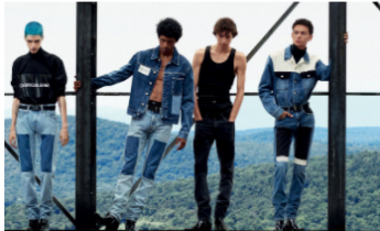
CALVIN KLEIN JEANS #MYCALVINS