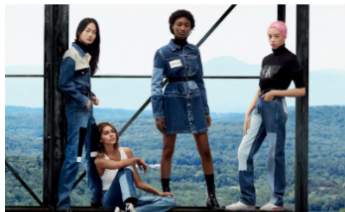
CALVIN KLEIN JEANS #MYCALVINS