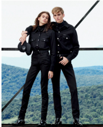
CALVIN KLEIN JEANS #MYCALVINS