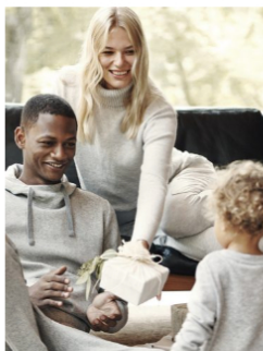
BANANA REPUBLIC HOLIDAY 2020 AD CAMPAIGN