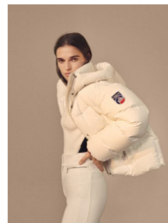
CHLOÉ SKIWEAR CAPSULE WINTER 2020 AD CAMPAIGN