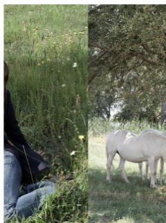
CELINE FALL 2020 AD CAMPAIGN