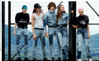
CALVIN KLEIN JEANS #MYCALVINS