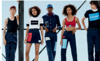
CALVIN KLEIN JEANS #MYCALVINS